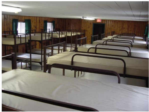
Interior of Cottage