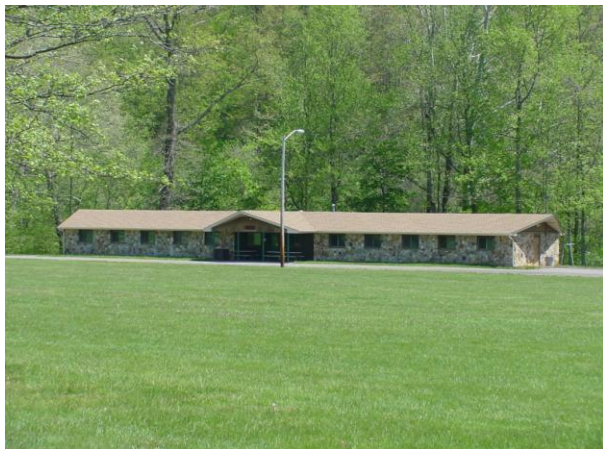
Outside View of Cottage