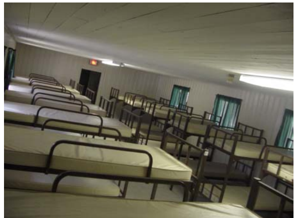
Interior of Cottage