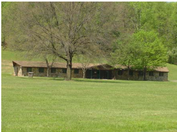
Outside View of Cottage